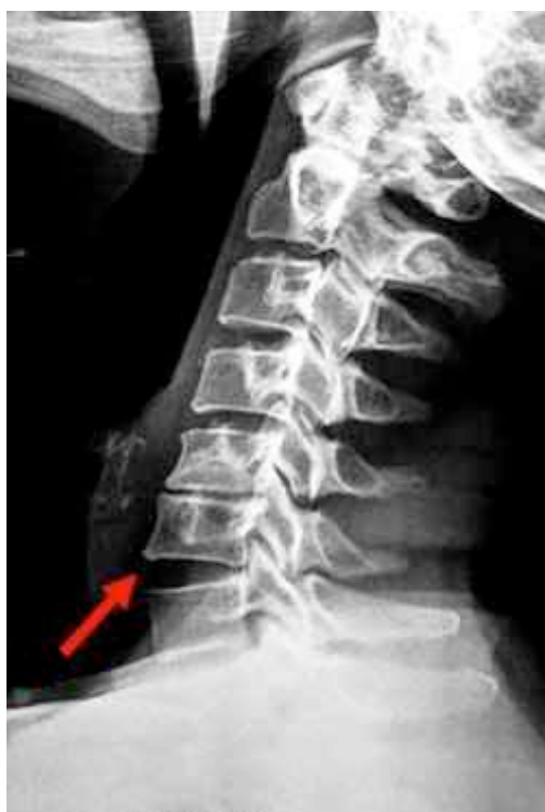
Fig.4.: Anterior somatic marginal osteophytosis with bone formation of bridges between the spinal bodies of C5-C6, C6-C7.

Radiological examination of the cervical rachis showed that considerable formations of osteophysis in bridge form were present at the level of C5-C6 and C6-C7 with straightening of the cervical rachis (picture 3).