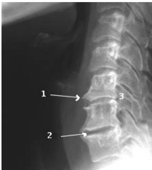
Fig.3.: It can be seen 1) marginal osteophytosis, in lateral projection it appears like bone spurs. The marginal osteophytosis sensibly reduces the diameter of the medullar channel, narrowing of one or more intervertebral spaces 2) reduction of the intersomatic space between two vertebrae (discopathy), 3) narrowing of connecting foramina 4) Increase of the physiological lordosis.

Patient felt pain upon palpation on C4-C7 uninjured cranial nerves. Muscular strength, reflexes and sensitivity of the upper limbs were at normal level, whereas plantar response was decreased. The radiological examination of the cervical rachis of the patient showed a degenerative disk pathology at an advanced stadium at the level C5-C6 with prominent posterior osteophytes.