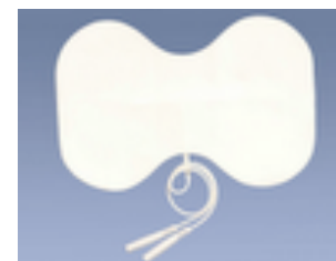
Fig.1: Stimulating device used for the treatment.